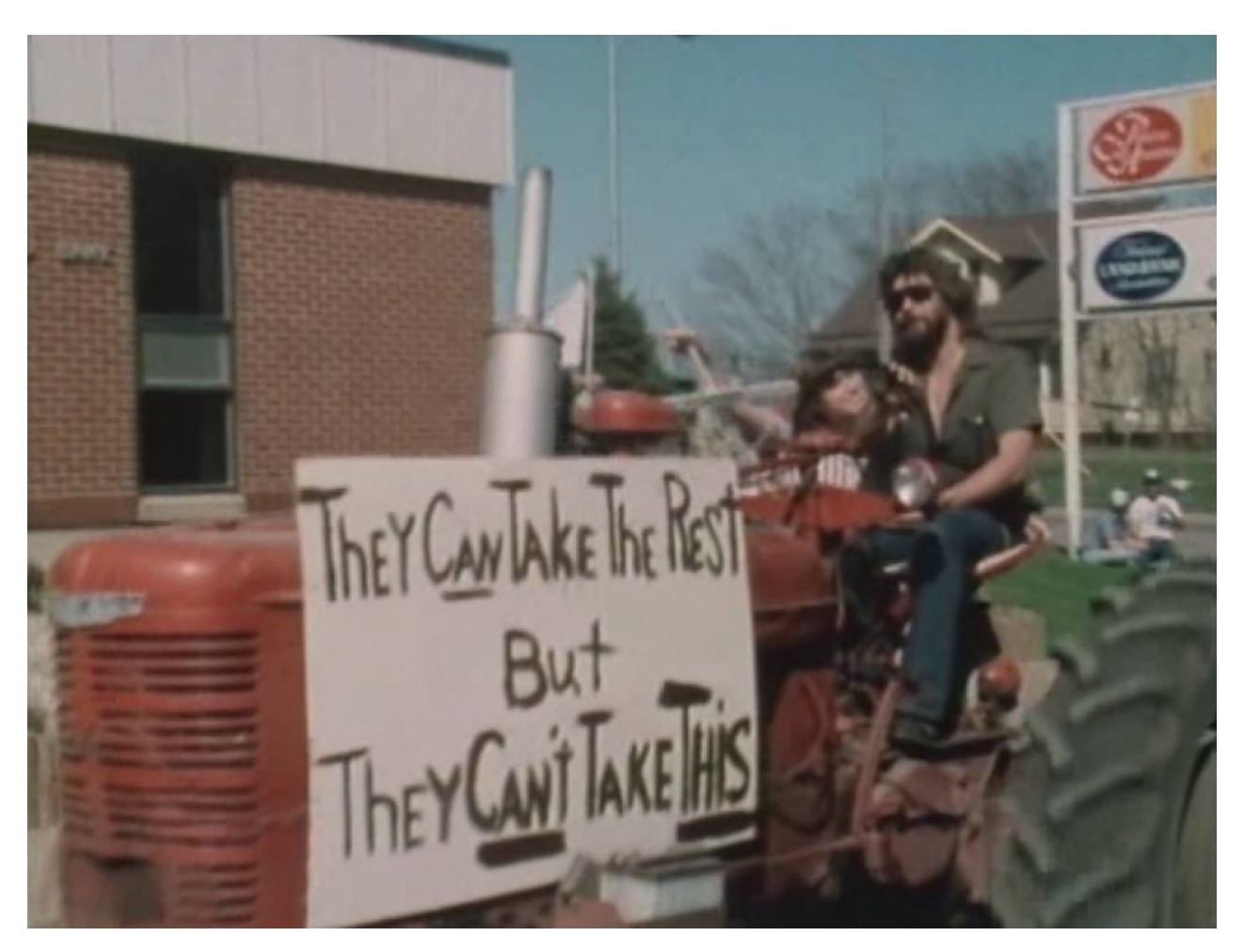
A scene from the Oscar-winning documentary "Down and Out in America," narrated and directed by Lee Grant.

"20<sup>th</sup> Century Woman: The Documentary Films of Lee Grant," presented online via the Coolidge Corner Theatre website