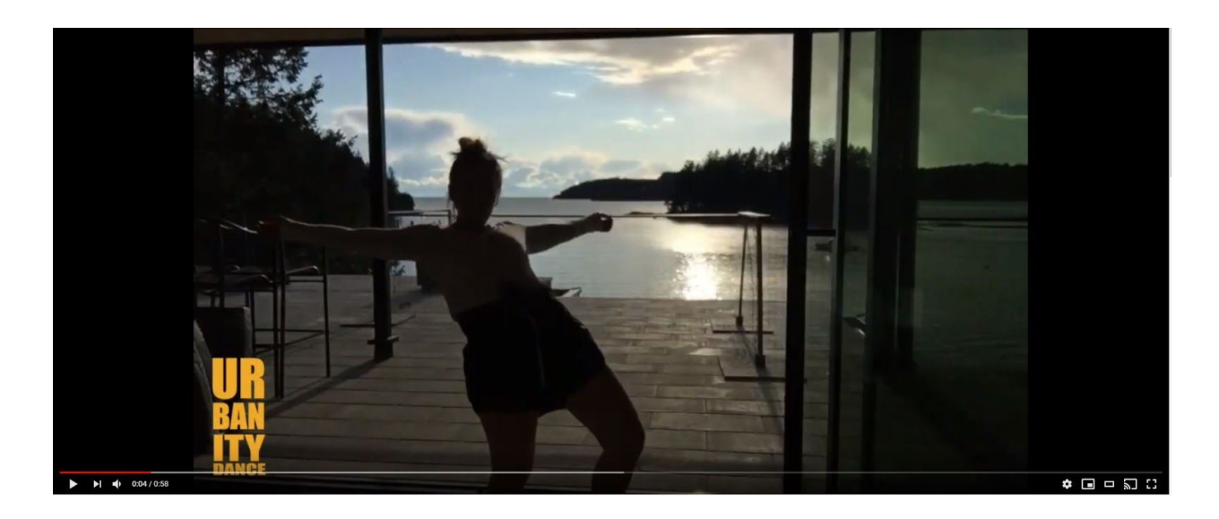
<u>Check out some of our students participating in our Intermediate/Advanced Contemporary Drop In.</u> Choreography by Cayley Christoforou.